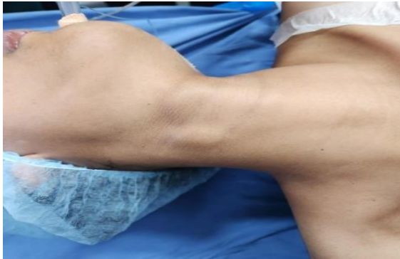
Fig:1 Preoperative presentation

The tissue underwent formalin fixation, processing, sectioning, and haematoxylin and eosin staining. According to histopathological results, the connective tissue beneath the cystic cavity had germinal centres. At various locations, the cystic epithelium was thrown into folds. Squamous epithelial strands that had been desquamated from the cystic epithelium could be seen in the cystic lumen. The connective tissue beneath revealed an abundance of lymphoid tissue with several germinal centres. There were features of fibrous connective tissue with fibroblasts and blood vessels lined with endothelial cells. Ziehl-Neelsen stain was previously performed to rule out tuberculosis, and Koch bacilli were not seen. A final diagnosis of an infected branchial cyst was made in light of all these findings. By the end of a six-month follow-up, the patient had fully recovered and had no recurrence.